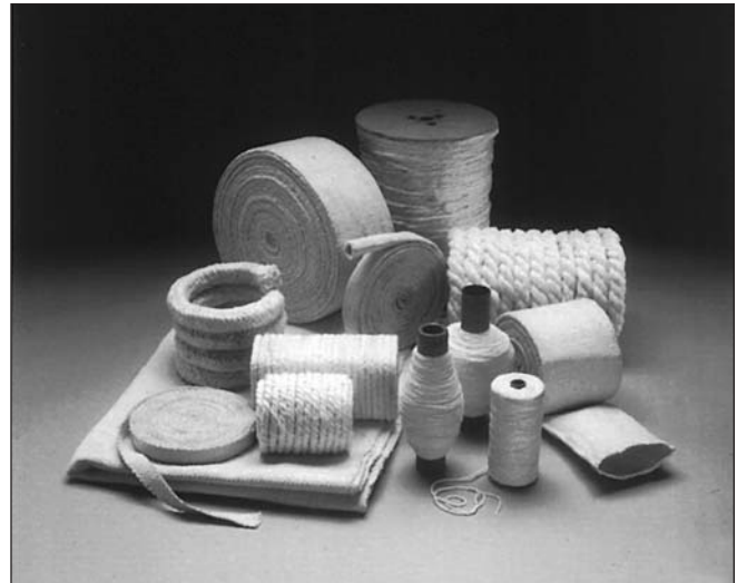
Fiberfrax Woven Textiles Product Family

For additional details on the available woven textile product forms, typical properties and applications for which they are appropriate, refer to Fiberfrax Woven Textiles, Product Information Sheet, Form C-1425.