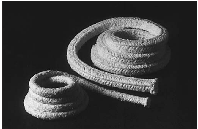
Fiberfrax Round and Square Braid

Fiberfrax wicking is a high temperature twisted roving made from Fiberfrax ceramic fibers and organic carrier fibers. It possesses the same thermal and chemical properties common to all Fiberfrax forms. It is typically used in applications that do not demand high tensile strength or compression resistance.