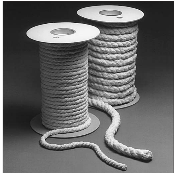
Fiberfrax Rope and HD Rope

Refer to the product Material Safety Data Sheet (MSDS) for recommended work practices and other product safety information.